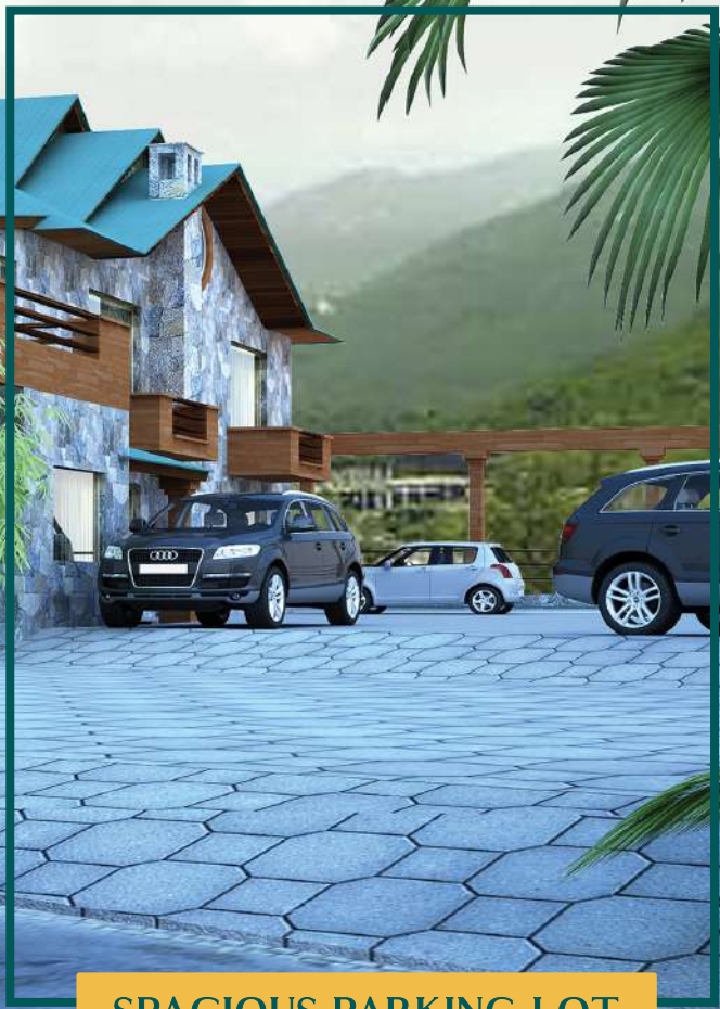
SPACIOUS PARKING LOT