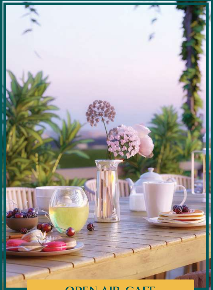
OPEN AIR CAFE